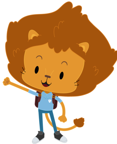
Elwood the Lion, an Enlightium Student

You will be informed of all of these events and activities through a direct message in Ignitia. You can also learn more about all of these activities in Enlightium's Knowledge Base .