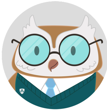
Professor Albert the Owl