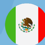
Spanish (Latin America)