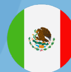
Spanish (Latin America)