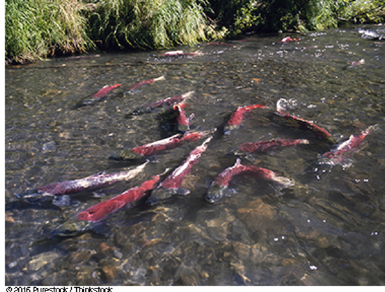
Red salmon in a river in Alaska.

The natural resources of Alaska provide most of the other jobs. Forests are cut to make lumber and paper. When the trees have been cleared, the land is good for farming and the soil is rich. Farmers grow grain and hay. Cattle and chickens are kept for meat. Fruits and vegetables are grown near the cities of Anchorage and Fairbanks. Fishing and fish processing are important industries. Salmon is the most common fish.